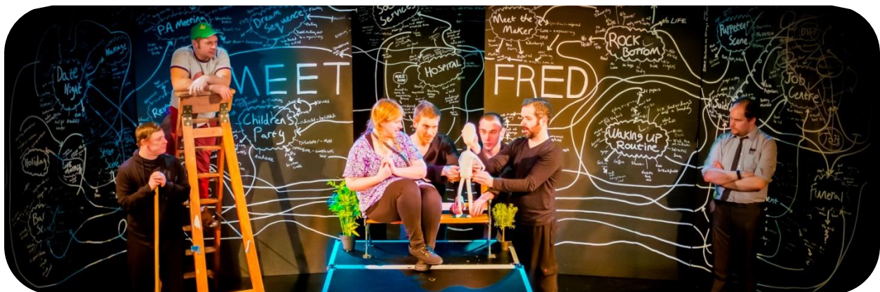
The original cast pictured in 2016.